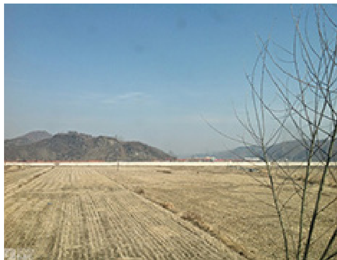
Much of Northeast China is this: hinterlands.

period are enough for propagandists in North Korea (and a vocal clique of South Korean liberals) to conclude that modern South Korea was born of impure taint. The true, pure nation, North Korea historiography would have us believe, is that which was founded by a true resistance fighter (not a dreaded “collaborator”): Kim Il-sung. While Changchun is some way from the Manchurian hinterlands where Kim Il-sung fought, the “imperial connection” reminds one of the great historical and national significance of Northeast China.