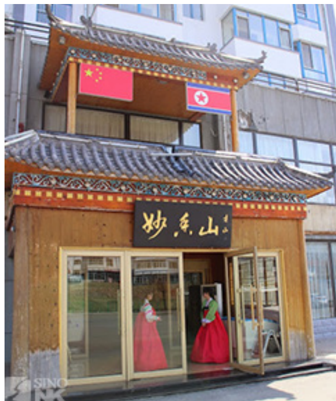
A joint venture restaurant in Ji'an.