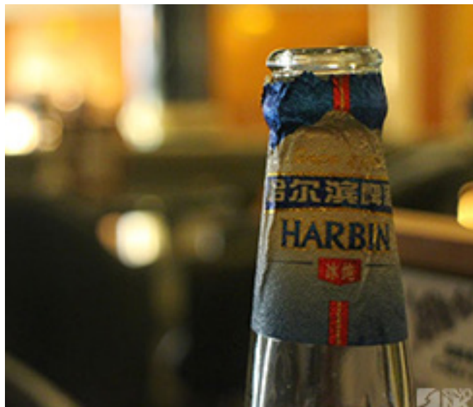
Harbin Beer is symbolic of the city’s colorful past. Founded by a German of Polish origin in 1900, the brewery was intended to sate the thirst of Russians then working on the region’s railways.

From a Koreanist-Sinologist perspective, the memorial is interesting and capable of uniting the disparate forces of Korean nationalism. However, the absence of Japanese stands out. Is there a similar absence at the prison in Lushun, the place of Ahn’s execution, where Japanese tourists tend to visit in larger numbers? Regardless, the ideological affinity between Ahn, Sun Yat Sen, and Liang Quichao is clear and comprehensible; the turn of the 20th century coincided with the rise of a generation of visionary East Asian nationalists, lauded from Beijing to Pyongyang and across the 38th parallel to Seoul.