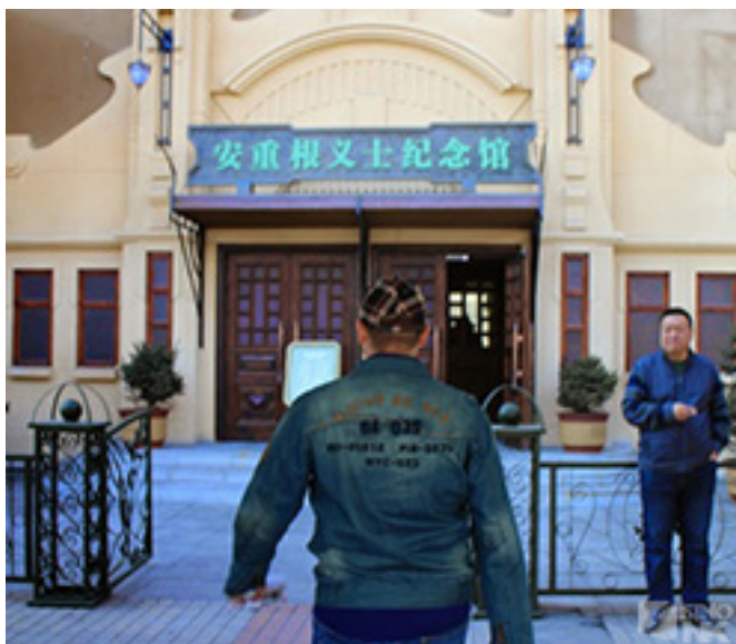
Adam, walking into the Ahn Jung-geun memorial exhibition at Harbin.

At this location in 1909, Ahn, a Korean independence activist and pan-Asianist, assassinated Ito Hirobumi, the first prime minister of Japan and resident-general of Korea. The exhibition, a small and largely unadorned room no bigger than a moderately sized lecture hall, contains photographs of Ahn, illustrative replicas of the assassination, and short descriptions about Ahn's life and his intellectual development presented in chronological order. Not surprisingly, there are no Japanese captions. Photo captions and biographical descriptions are in Chinese and Korean only.