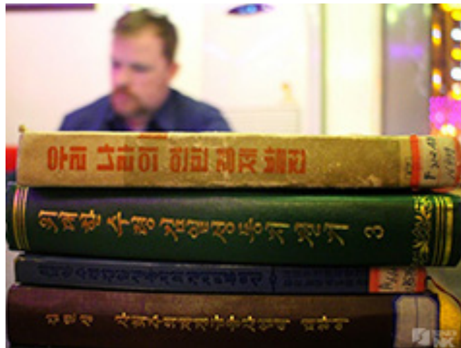
Coffee shops are invaluable as places of writing, relaxation, and planning whilst conducting field work.

to create the conditions under which business could truly boom. Until then, Yanji is destined to remain a peripheral city with an interesting vibe; potential unrealized.