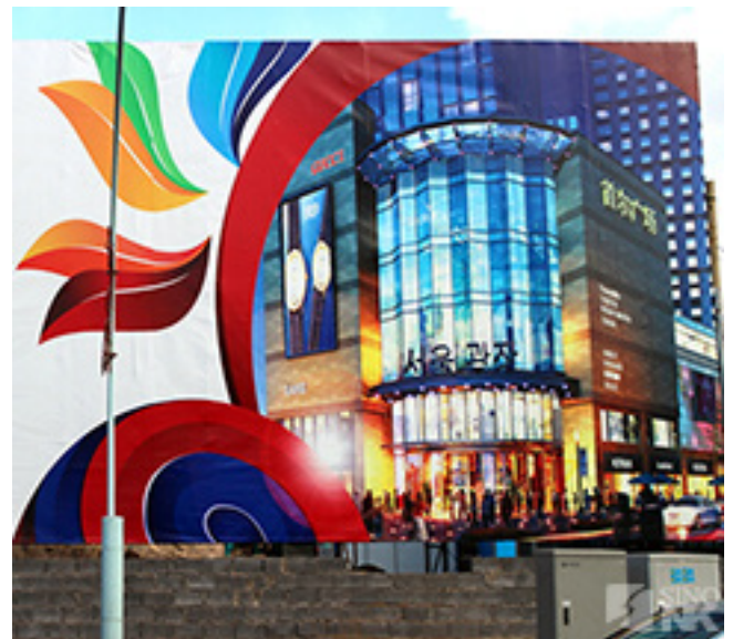
Advertisement for “Seoul City Mall,” supposedly coming soon to Shenyang.

way. If appeal to a mass audience is the metric, then the victor is clear, and North Korea will have to find a new way to define itself, to see if it sells.