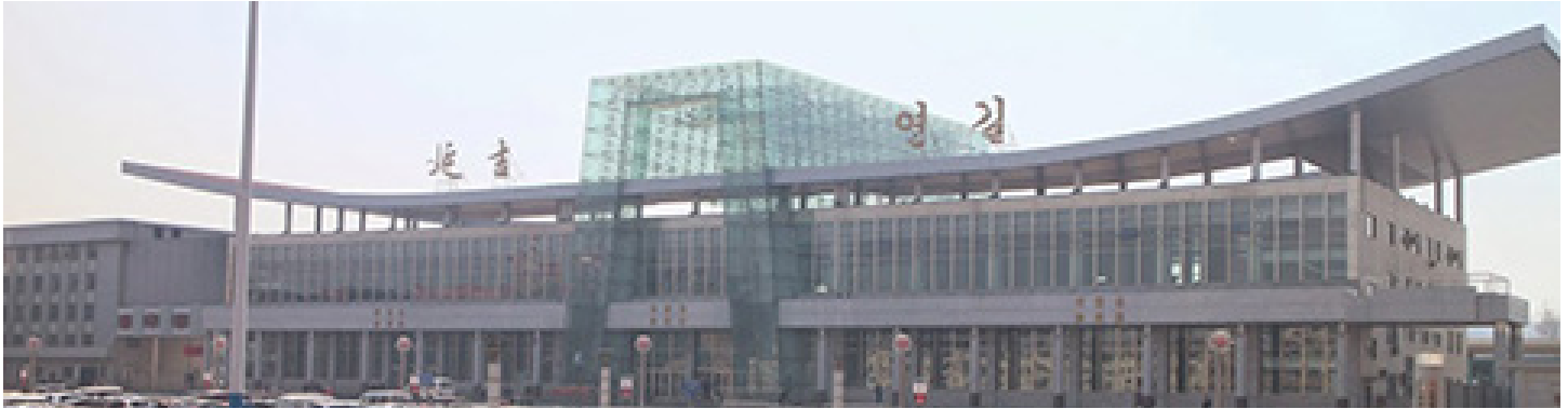
The Yanji train station: a hub for travellers of the Yanbian Autonomous Prefecture.

Who wins in the battle for the hearts and minds of diaspora Koreans? In the United States and elsewhere, the battle is almost non-existent, but Northeast China is a different story. Traditionally from and loyal to North Korea, there is now the option for the “Chosonjok” to live and work in South Korea under a liberal visa regime, and many do so. It is difficult to justify loyalty to one’s roots in such a situation, where opportunity knocks so loudly on the wrong side of the tracks.