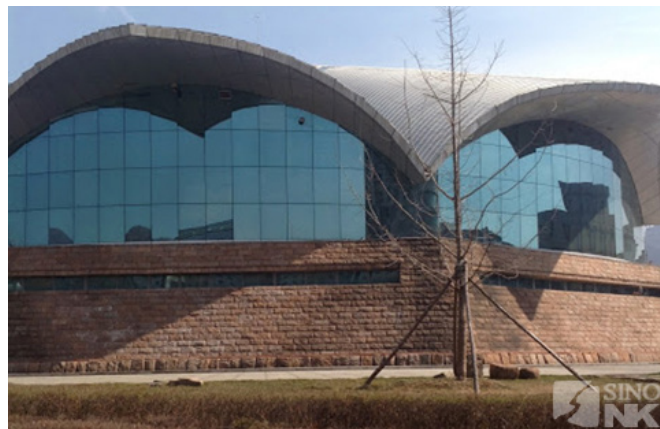
The Koguryo Museum, where the AFP reporter was expelled for taking photos inside.

An AFP reporter, one of the only foreign correspondents to visit in 2013, was escorted out of town for apparently violating the rules of the museum. Our visit was, thankfully, far less dramatic.