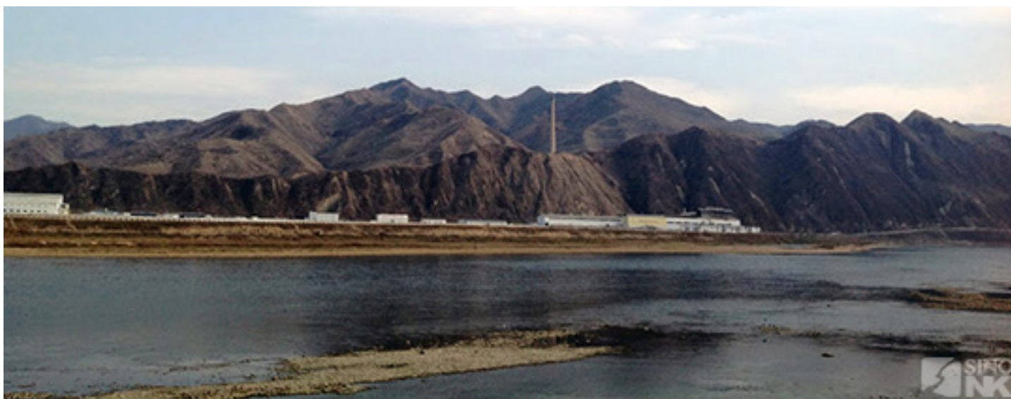
Manpo, DPRK, opposite Ji'an, on the banks of the Yalu. Hundreds of thousands of Chinese volunteers crossed this river, frozen at the time, during the first year of the Korean War. The sacrifices made by many Chinese soldiers in Korea forged a relationship, bound by blood, between China and North Korea.