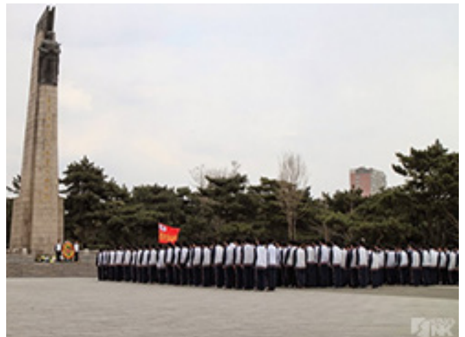
Primary school children pay their respects to fallen Chinese Volunteers and thus they "remember."