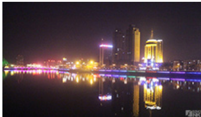
The bright city lights of Tonghua.

But time waits for very little in China, and just days after leaving Ji'an we received news that sounded a lot like progress: another new cross-border connection would soon be opening up. As Xinhua put it on April 13, "Another Chinese city opens train travel to Pyongyang."