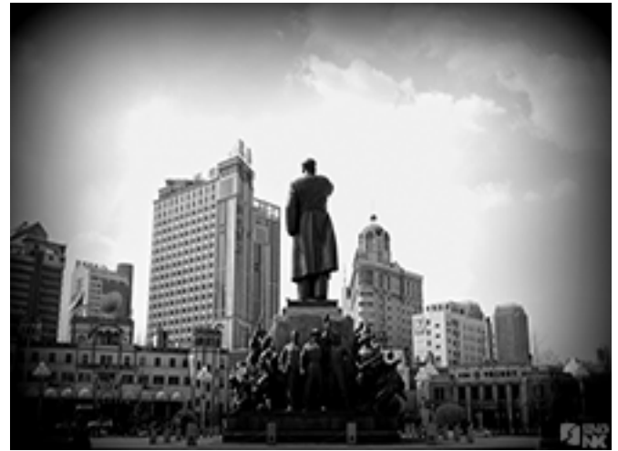
Statue of Mao, Shenyang. The largest statue of the Communist leader in China.

But the Chinese children seemed disinterested. Chinese children are children, one might indeed say, and as a result the marching was lackadaisical, fists went un-pumped, speeches were delivered with minimal ambition; nevertheless, the state's intent to memorialize the Korean War, with all the challenges that such an undertaking inevitably brings, is clear here.