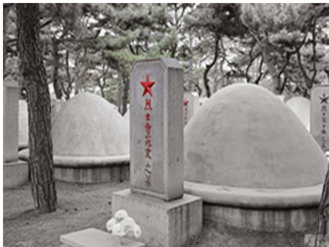
Tombs of fallen comrades in the War to Oppose America and Aid Korea, AKA: the Korean War.

One pertinent lesson, then: for China to abandon North Korea would actually require much more to be abandoned than Western observers tend to appreciate. That the War to Resist America and Aid Korea was launched on the initiative of Kim Il-sung is certainly no secret to anyone in China, and that does create problems of perception. Nevertheless, it was Mao Zedong who made the fateful case for an immense communal sacrifice from a people just emerging from the tumultuous founding of a state, and so that sacrifice had to be made, and memorialized. Shenyang only makes it clear that more sacrifices, psychological rather than physical, are still being made, and that same war is still being fought... in Manchurian classrooms.