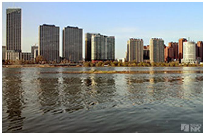
Jilin plays home to many legal North Korean workers.

North Korea takes its links to Jilin Province very seriously. The point is proved by a half hour-long KCTV documentary film shown on April 4 about Gilim [Jilin] Prison, where a young middle schooler called Kim Il-sung was incarcerated for six months. Showing, without fear one notes, modern Jilin where the prison once stood, the film has its cars, its Samsung sign, and the bustle and hubbub of a modern city, but the narration is a lament to the horrors of a place that, it is clear, North Korea seeks to portray as the wellspring of its painful legitimization.