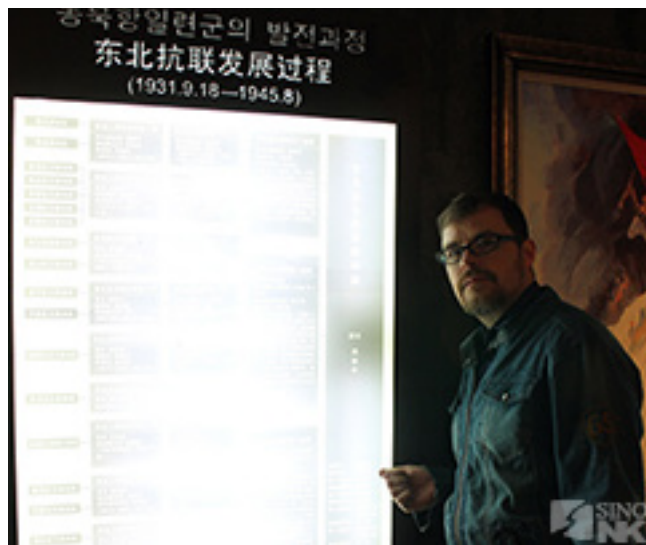
It takes a keen eye to spot the few mentions of Kim Il-sung on the walls of the grand new Yanbian Museum, testament to the scale of his role in the guerrilla war to liberate Korea.