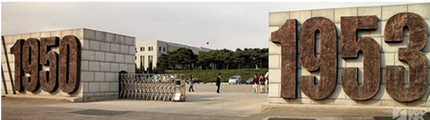
Entrance to the Shenyang Korean War Martyrs Memorial Park.