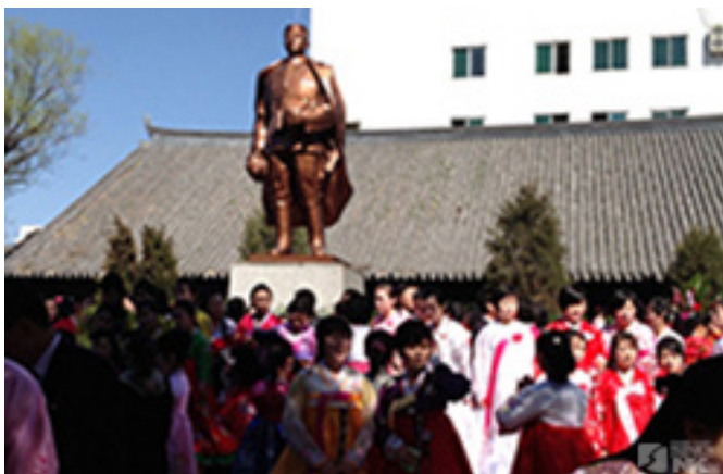
Kim Il-sung in guerrilla garb at Yuwen Middle School.

On the Day of the Sun (April 15), as the North Korean side refers to the birth date of Kim Il-sung, the main means of celebrating is to gather early on in the morning at Yuwen Middle School, where Kim spent a few years studying before here found himself jailed for engaging in subversive activities.