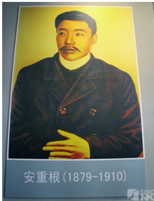
Ahn Jung-geun, the Korean independence fighter who killed Ito Hirobumi.

Halfway through the exhibition, visitors are encouraged to look out through a large glass window onto the platform where Ahn fatally shot Ito, in addition to wounding several other high-ranking officials; a few inconspicuous markings indicate from where the shots were fired and where they found their intended targets. The exhibition culminates with a quote from Ahn, reportedly uttered shortly before his execution, reflecting his Pan-Asianist vision for the region.