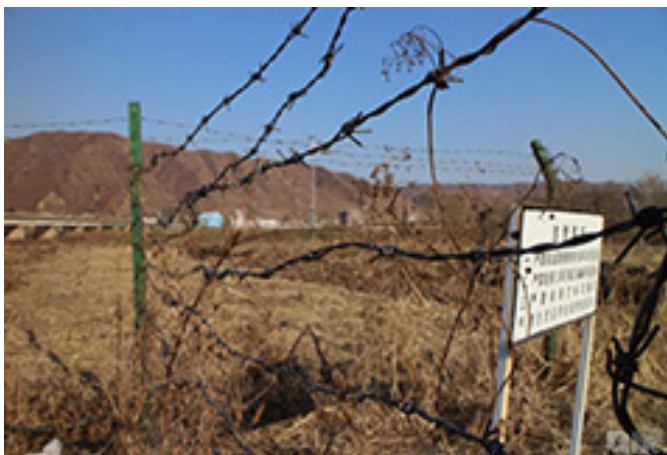
The Tumen-Namyang border region at the Tumen River.

Liminal borderland spaces fail to characterize the borderland between China and North Korea satisfactorily. Of course the space is liminal, physically in terms of occupying the two sides of the Sino-North Korean border and in a metaphysical sense. But liminality doesn't speak well to the differences observed along this extended frontier.