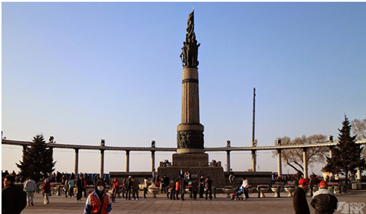
The Harbin Flood Control Memorial Tower on the banks of the Songhua River, which flooded badly in 1957.